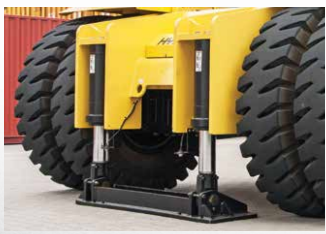
The heavy duty, innovative stabilizer for our big trucks increases stability and reduces tire wear on the rear axle.