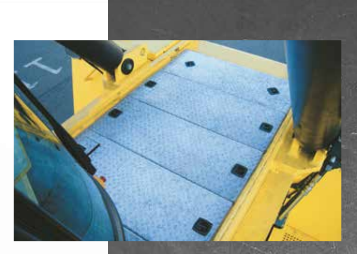
Lightweight, aluminum floor plates enable quick removal for easy service access.

Take your fleet operation to the next level with wireless asset management from Hyster. Hyster Tracker provides a scalable solution for fleets. From monitoring truck utilization to limiting operator access, Hyster Tracker allows you to track your fleet at your fingertips.